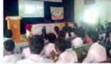
शिंदखेड्यात आंतरराष्ट्रीय युवा दिनानिमित्त एड्सविषयी ई-लर्निंग सेमिनारचे उद्घाटन करण्यात आले.

आंतरराष्ट्रीय युवा दिनानिमित्त आंतरराष्ट्रीय युवा दिनानिमित्त आंतरराष्ट्रीय युवा दिनानिमित्त आंतरराष्ट्रीय युवा दिनानिमित्त